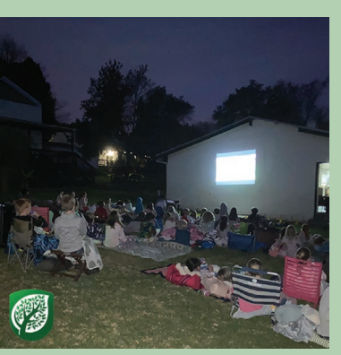
Page 5 of 8